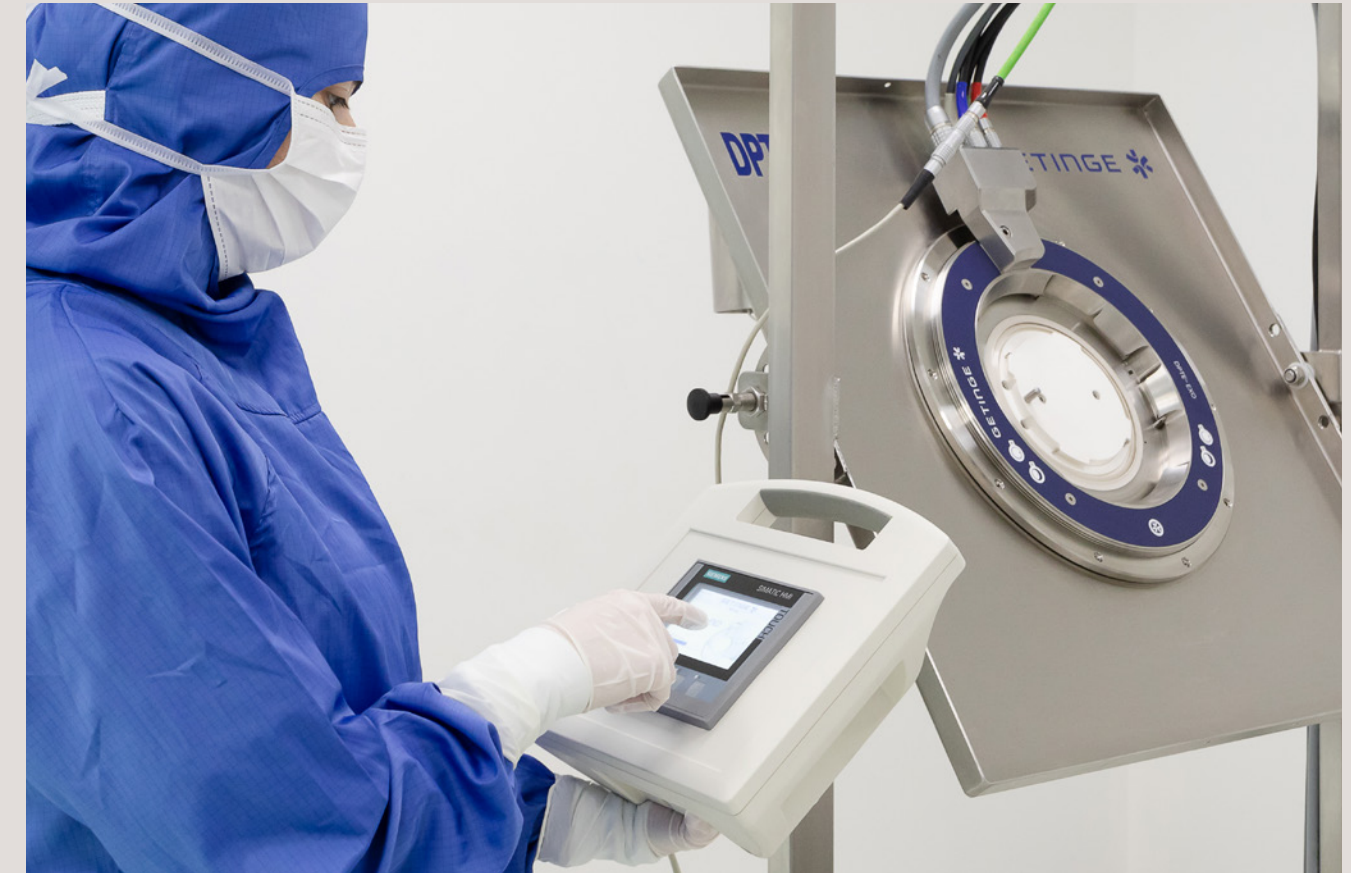
DPTE®-EXO WITH SLEEVELESS DPTE-BETABAG

All the movements performed by the DPTE-EXO and its optional funnel are fully controlled. The DPTE-EXO is configured to receive information from the filling line such as an emergency stop and/or safety light curtains. The automated process is interrupted when meeting an obstacle ensuring both process and operator safety. In addition, the alpha port can be switched from automatic to manual mode using the optional portable maintenance display for corrective or preventive maintenance or in case of an emergency.